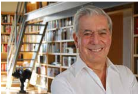
Mario Vargas Llosa

The great Peruvian writer and 2010 Nobel Laureate in Literature, Mario Vargas Llosa visited the UD campus for a series of high-profile events in fall 2013. His visit was the final part of the "Transnational Encounters" visiting authors series, made possible through a cornerstone grant from the College of Arts & Sciences' Interdisciplinary Humanities Research Center. In May 2012, FLL hosted the first Nobel Laureate in Literature ever to visit the University, renowned French writer Jean-Marie Gustave Le Clézio, under the auspices of the same series.