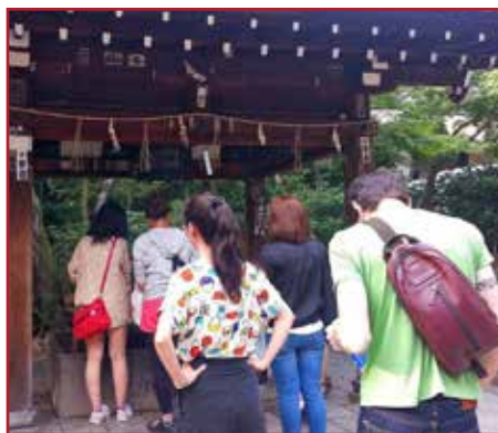
2013 Kobe participants and their language partners explore a small shrine in Kyoto