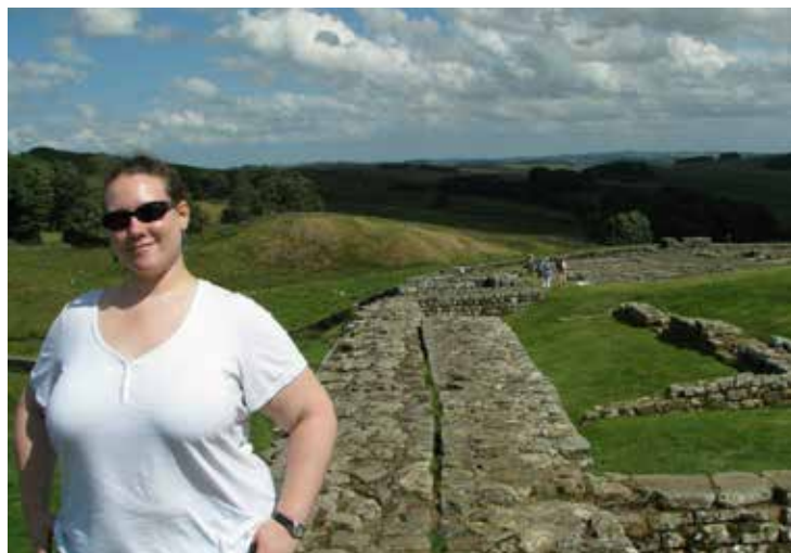
Walking Hadrian's Wall at Vercovicium (Housesteads Fort), northern England, summer 2013.

Today, my education in the Latin language has proved most useful in regards to grammar and syntax. Latin is one of those languages that teaches English speakers certain rules, such as when to use 'whom,' what the actual plural of 'femur' is and why, and why the correct phrase is actually 'data are.' I am currently an Associate Editor for the Plains Anthropologist journal, and have frequently applied this knowledge during the copyediting process. A major way I was influenced by my AGRS concentration shows in my love of both language structure and etymology, and also with creative writing. Official academic work aside, my hobbies lately involve some scribbles of fiction, and even helping a group of uber-nerds to expand the lexicon of a fictive language from a popular video game. I know exactly which classes inspired me to write (and helped me prove to myself that I was a decent writer), and one of those classes was the Society and Spectacle course, for which the final assignment was a diary or short story. (My better half is convinced I should write archaeologically-themed children's books, but we'll see...)"