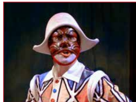
A scene from the Goldoni comedy The Servant of Two Masters