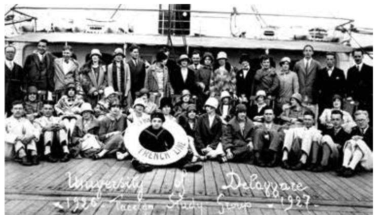
Because few colleges were willing to set up a program like UD's, the American Council on Education asked the University to expand its Junior Year Abroad to include as many students as possible from other institutions. The 1926-1927 group, shown here, included forty-three students from nineteen colleges.

The University of Delaware launched America's first study abroad program on July 7, 1923, when a group of eight Delaware students set sail for France aboard the ocean liner Rochambeau .