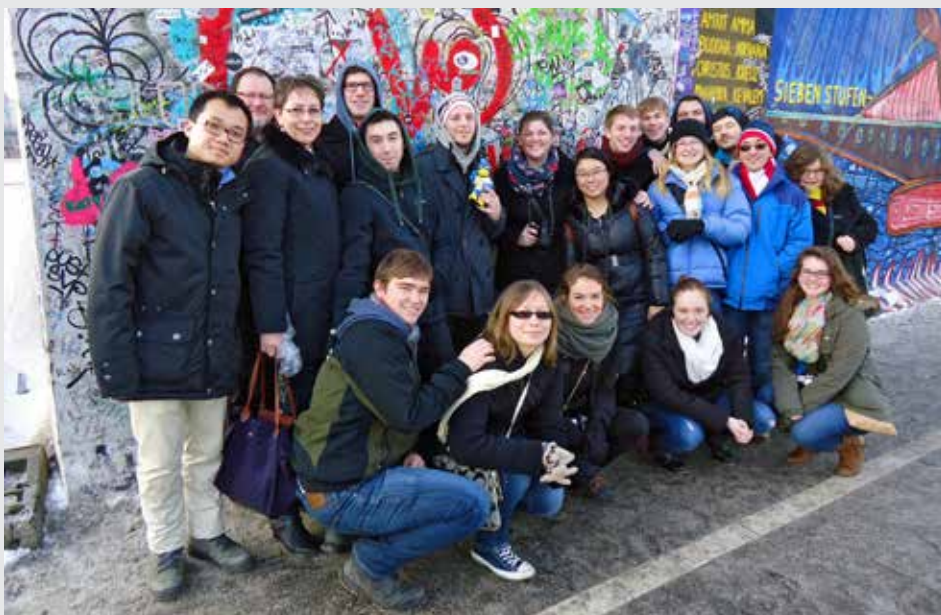
Leipzig 2014 group at the East Side Gallery