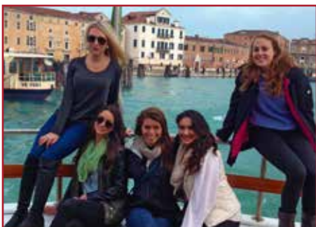
Siena winter 2014 students on the Grand Canal in Venice

from the Università di Siena. These encounters allowed UD students to meet people of their age, learn more about Italian culture, and improve their ability to speak Italian. During the first two weekends the group visited Florence and Venice.