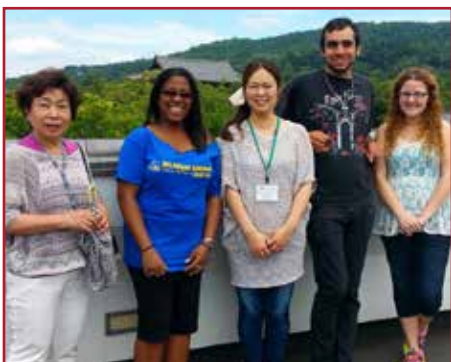
2013 Kobe participants with a home-stay family in Nara