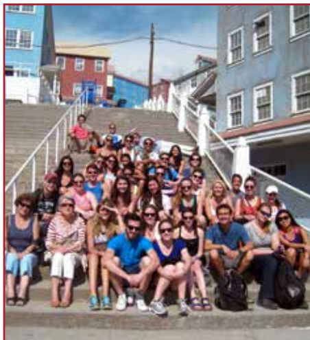
Chile 2014 group at the Sewell Mine