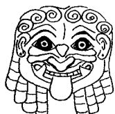
Medusa from a 7th century BC terra cotta from Syracuse

The group was sad to leave Caen, but thankful for the experience. As one student put it: "It is impossible to take this trip and not be inspired!"