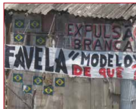
Political graffiti at favela Santa Marta