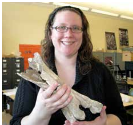
Holding a reconstructed bison antiquus humerus from the Carter/Kerr-McGee site in northeast Wyoming

What can you do with a major in Ancient Greek and Roman Studies? For starters, you can write the